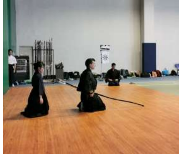
Yawatashi