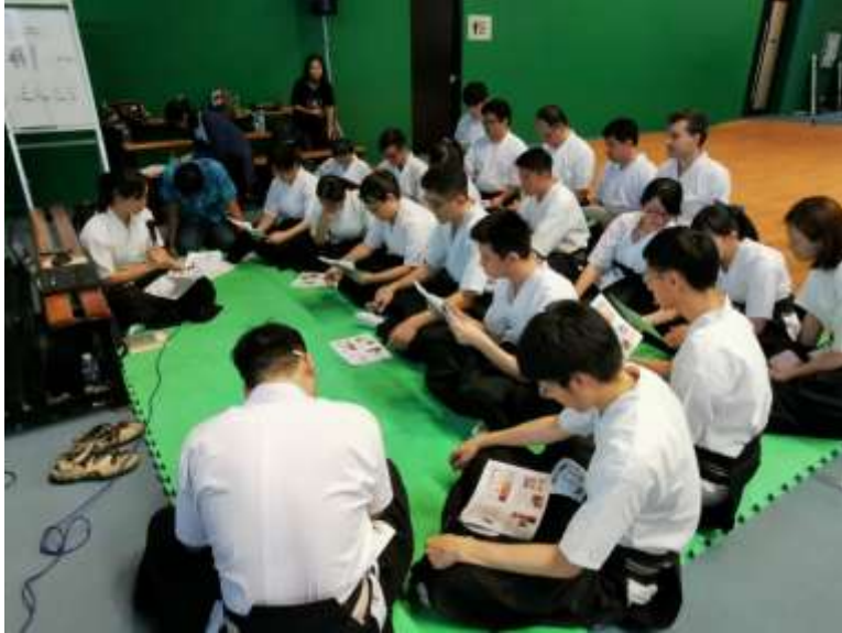
An introduction of History and technique background of the Japanese traditional bow by Hong Tzu-Ning from Tomotsugu Goka Notes