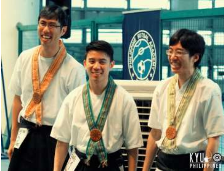
Individual competition awardees 1 st to the 3 rd from right to left