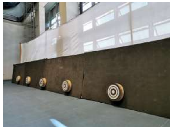
Azuchi and Protective net