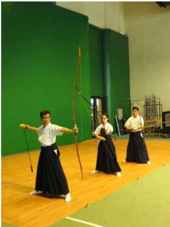
Demonstration of Heki Ryu Insai Ha Style shooting by team Malaysia